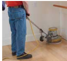
Rotary Floor Buffer