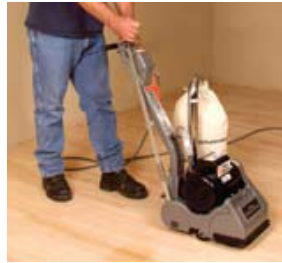
Expanding Drum Sander

Be sure to ask your rental store representative for a copy of the "Finishing or Refinishing Wood Floors" video to help with your project.